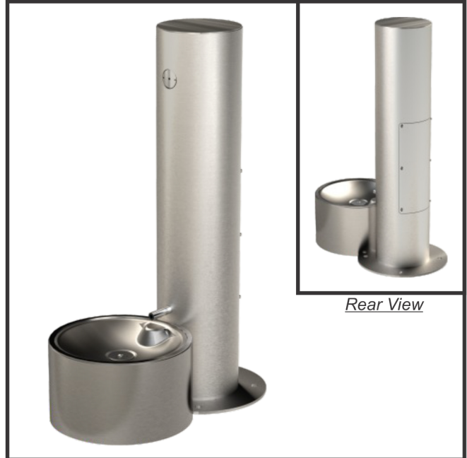
Model M-PM34 Shown

Unit shall be constructed of 14 gage type 304 stainless steel polished to a satin finish with 18 gage pet fountain bowl. Bottom plate shall be 3/16" thick and include three mounting holes with two additional mounting holes for pet fountain. 1/2" expansion anchor bolts shall be furnished. All other exposed fasteners shall be vandal resistant stainless steel screws.